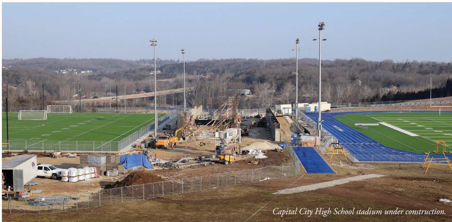
Capital City High School stadium under construction.