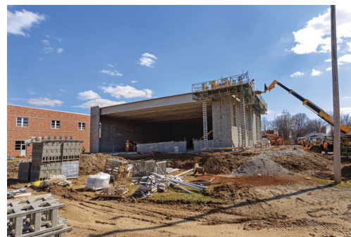
Jefferson Middle School gymnasium under construction.