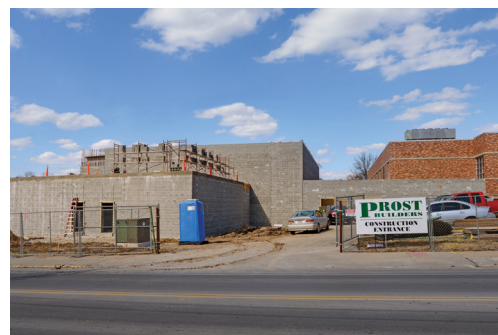
Jefferson Middle School locker rooms under construction.